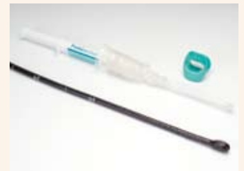
Non latex TOE/TEE cover

X-ray departments are carrying out many types of ultrasound scanning procedures. In this particular discipline, a wide range of ultrasound probes are used, including linear, sector and convex probes. In this field, Probetection™ is offering a range of sterile covers and cable cord covers.