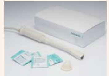
General purpose covers

Transvaginal transducers are widely used in gynaecology ultrasound scanning procedures. Do you prefer a snug fit, or would you like to have the entire probe covered including the handle? Probetection™ offers perfect fitting covers for all trans-vaginal probes.